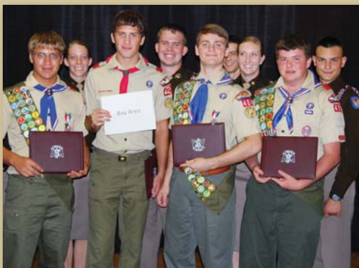
Bay Area (Galveston)