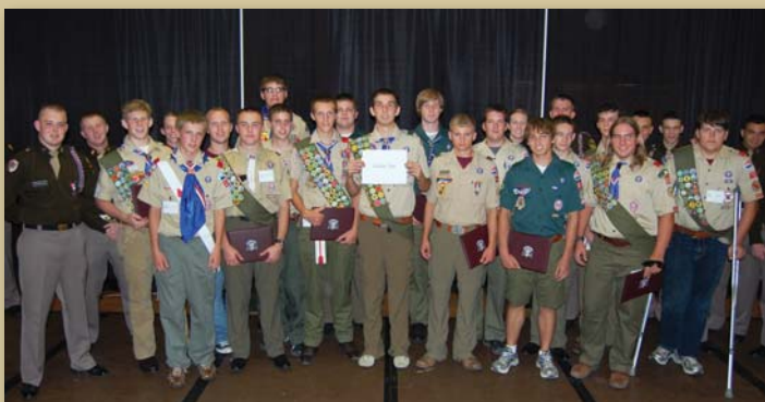
Circle Ten (Dallas)