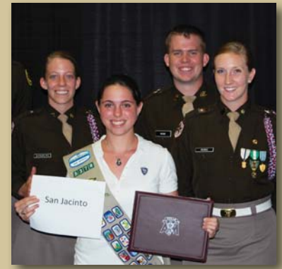
San Jacinto (Cypress)