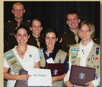
Girl Scouts of Central Texas and Eastern Oklahoma