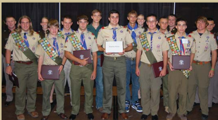
Alamo Area (San Antonio)