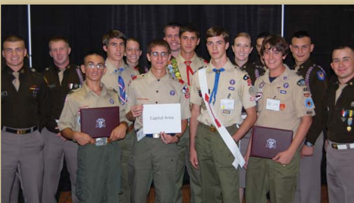
Capital Area (Austin)