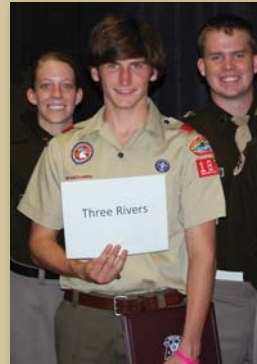
Three Rivers (Beaumont)