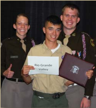
Rio Grande Valley (McAllen)