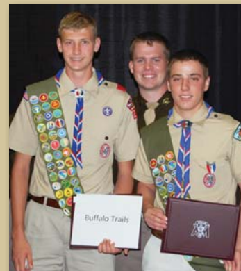
Buffalo Trails (Midland)