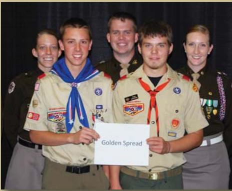
Golden Spread (Amarillo)