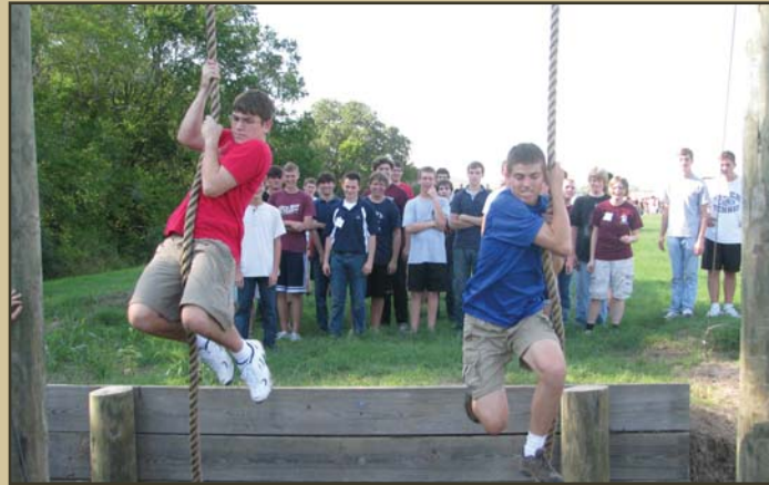
Above: Two AEP participants lead the group through part of the Corps' Obstacle Course.

If you decide to attend the Aggie Eagle Program, you will meet Scouts from around the nation. You will also learn about the Aggie Code of Honor, Aggie Spirit and have a unique experience that allows you and your parents to make an honest assessment of what it means to be an Aggie and a member of the Corps of Cadets.