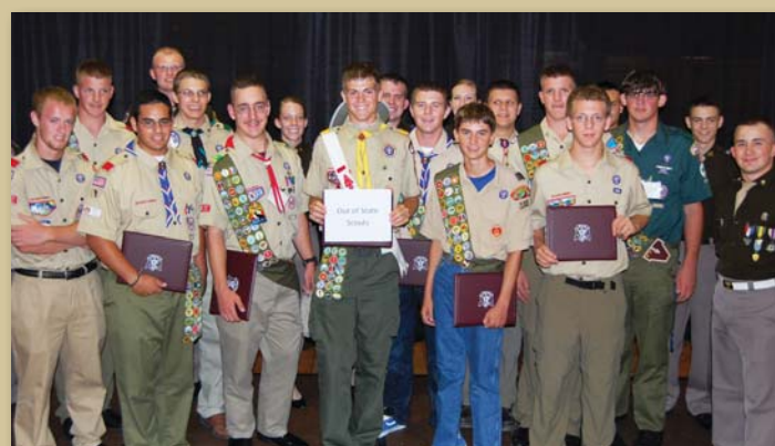
Out of State