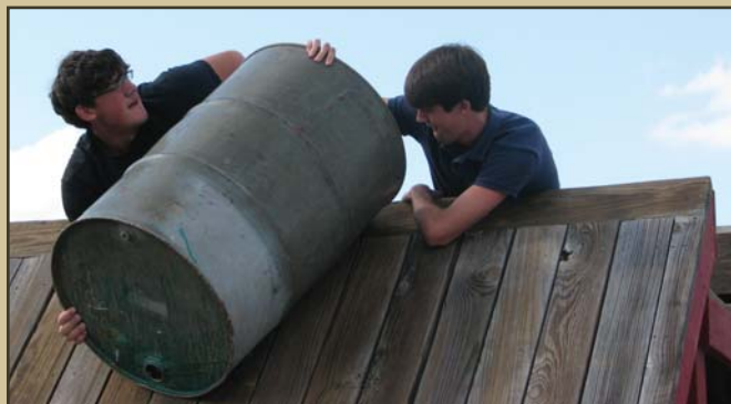
Physical training at the Leadership Development Course allows AEP participants the chance to work together to complete an objective.

Typically, the Corps has over 300 members who hold the BSA Eagle or GSUSA Gold Award. The Program recognizes that the same traits that motivate a young person to join Scouts also encourages them, as collegians, to join the Corps of Cadets.