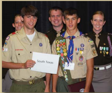
South Texas (Corpus Christi)