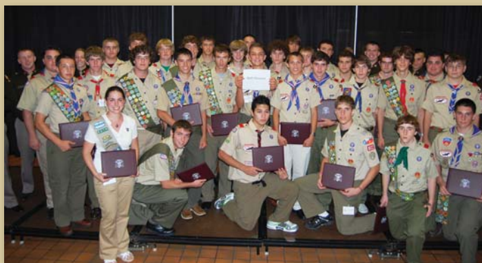
Sam Houston (Houston)