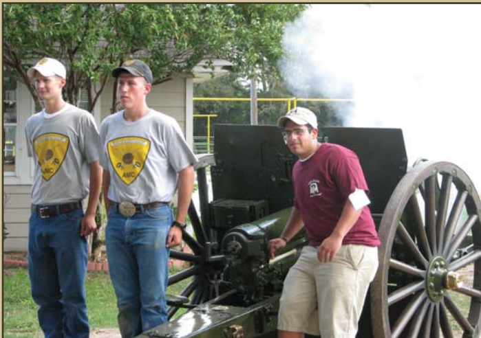
An AEP participant sets off the "The Spirit of '02" cannon at Fiddler's Green, the 65-acre Parsons Mounted Cavalry headquarters and training facility.