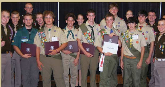
Longhorn (Fort Worth)