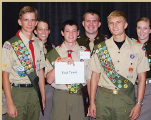
East Texas (Nacagdoches)